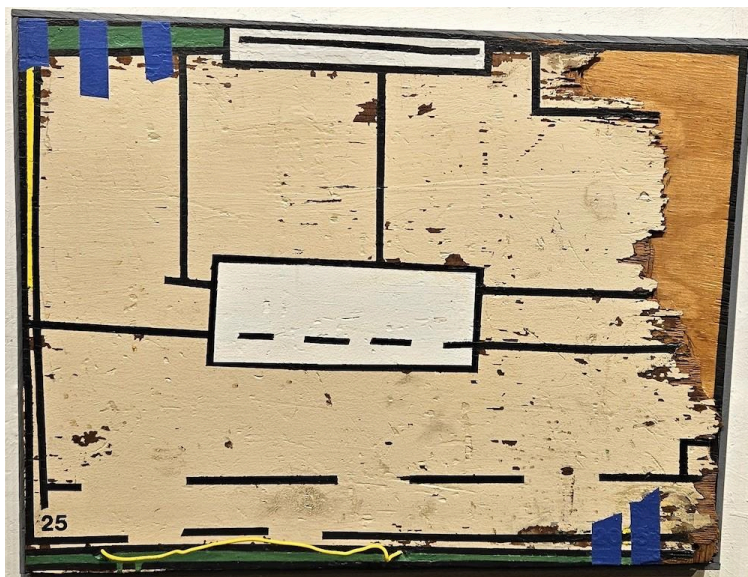
LEVEL , 2025, Enamel paint, metal, wire, on found plywood, 18" x 24"