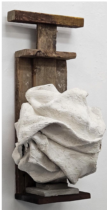
Lapped , 2025, Burlap, wood, latex tubing. 30.5" x 16" x 14"

Concrete, plaster, wood lath, wood filler, and found objects are the materials of choice for New York artist Gerald Wolfe. He cuts, scrapes, and patches to create his art—yet always preserves the inherent character of the materials. Wolf's works often suggest recognizable objects, while simultaneously carrying the mystique of the new and abstract. Each piece possesses stature, a sense of place, and an implied history, while infused with energy.