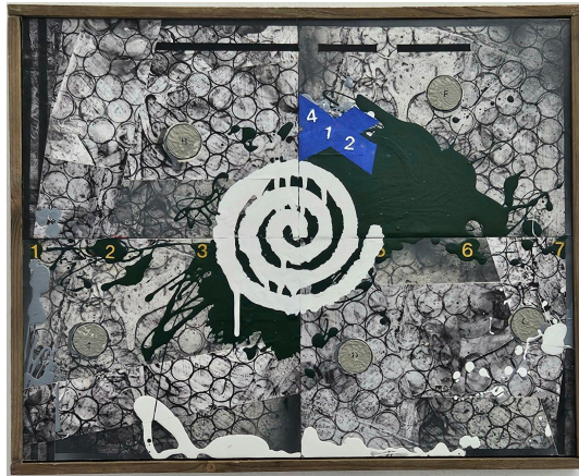
"412", 2024, Enamel paint, spray paint, wood on reproduced image on paper over board, 17" x 21"